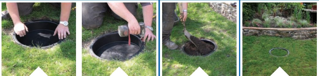
Replace with the Chameleon®